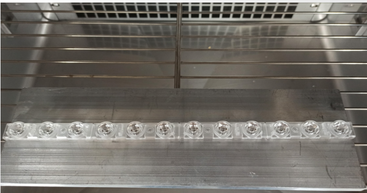
Photo: the part in the climatic chamber after testing.